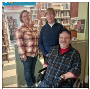
Access Independence Visit

The Library merges a historic residence with an addition built in 2002. The historic section of the house reflects the charm and hospitality of bygone days. The addition doubled the size of the Library and added library-like space.